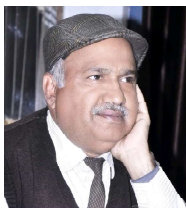
By: Vijay GarG

The Right to Education Act 2009 maps out roles and responsibilities for the centre, state and all local bodies to rectify gaps in their education system in order to enhance the quality of education in the country.